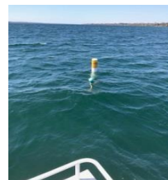
Rothesay mooring – May 5, 2018