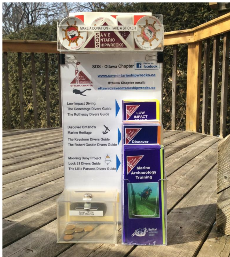
Example of SOS Ottawa donation box.