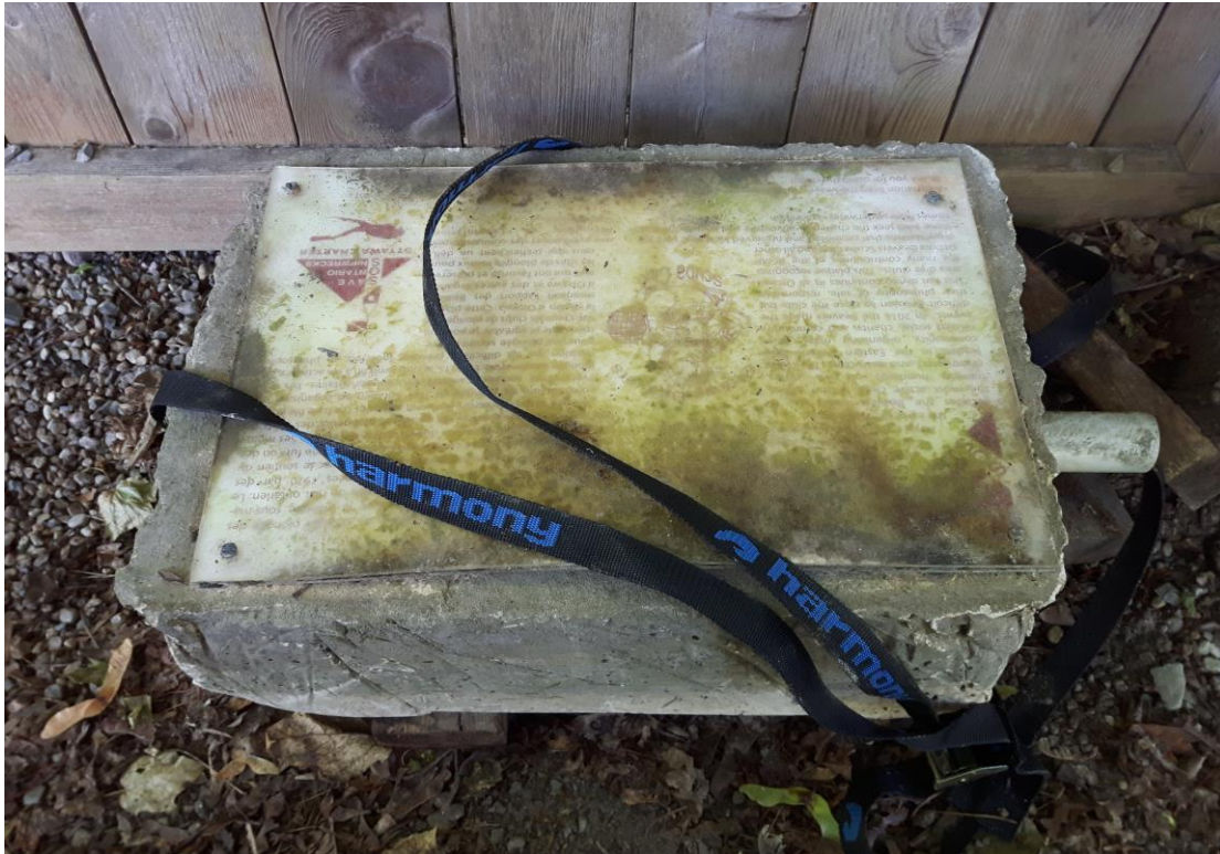
Beavers plaque – before.