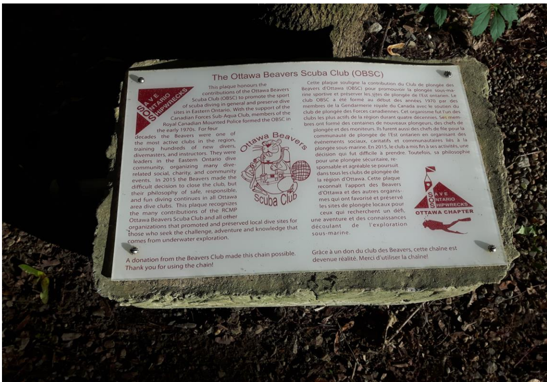
Beavers plaque – after.