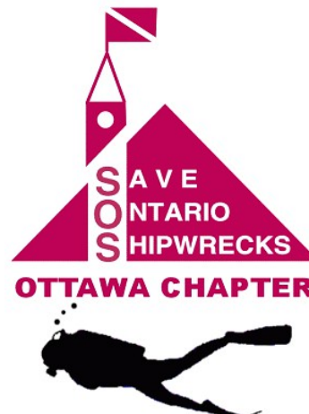
Save Ontario Shipwrecks - Ottawa - BMO Account Summary