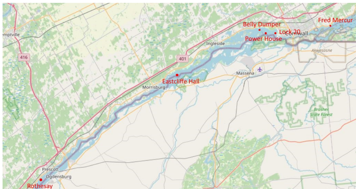
SOS Ottawa mooring plan for 2022 season.