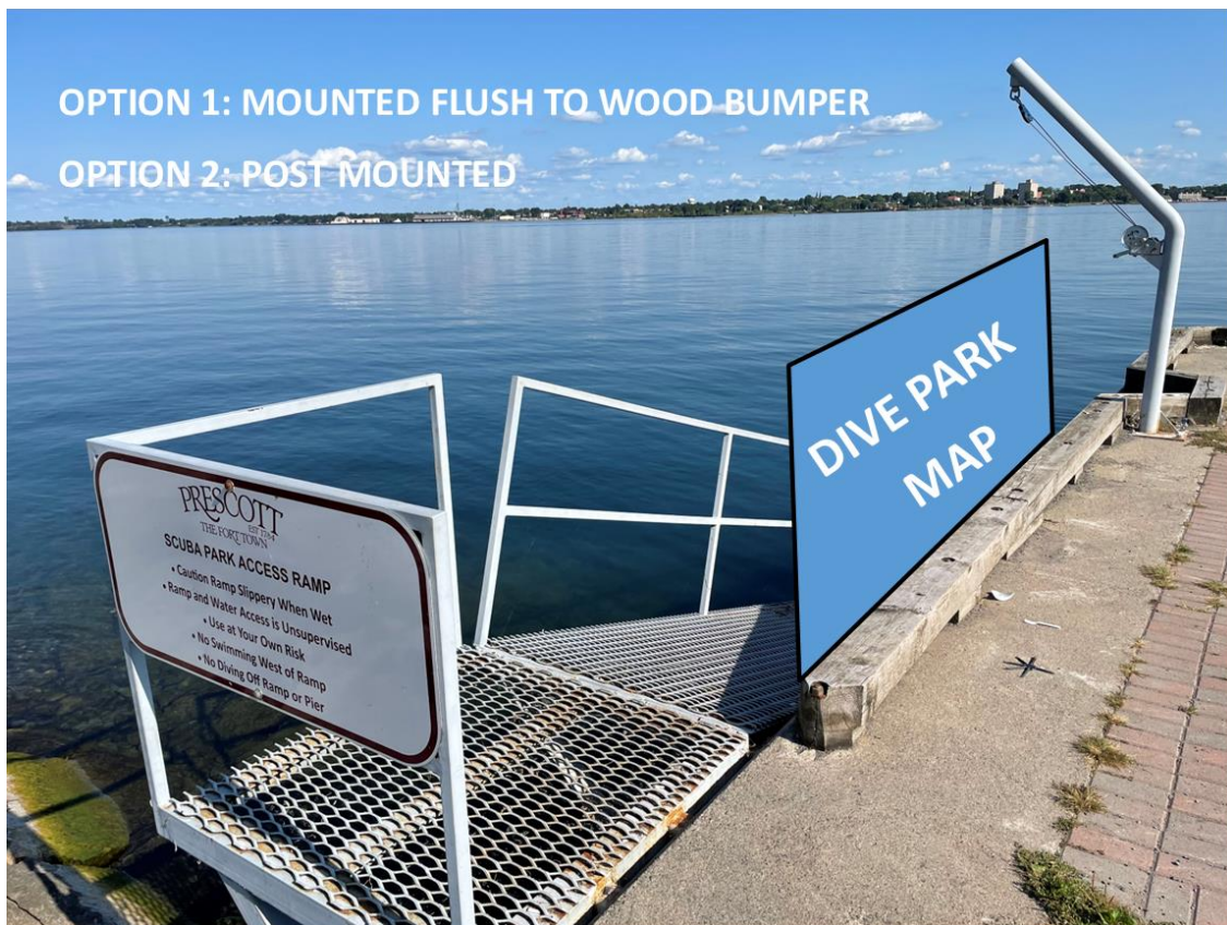
Proposed location for large dive park map at Prescott Scuba Park.

Rick says the proposed placement of the map would interfere with divers getting in the water, as many of his students like to put their gear on the wood bumper beside the ramp before getting in the water. Nancy says the proposed placement at ground level could lead to damage from snow clearing operations during the winter.