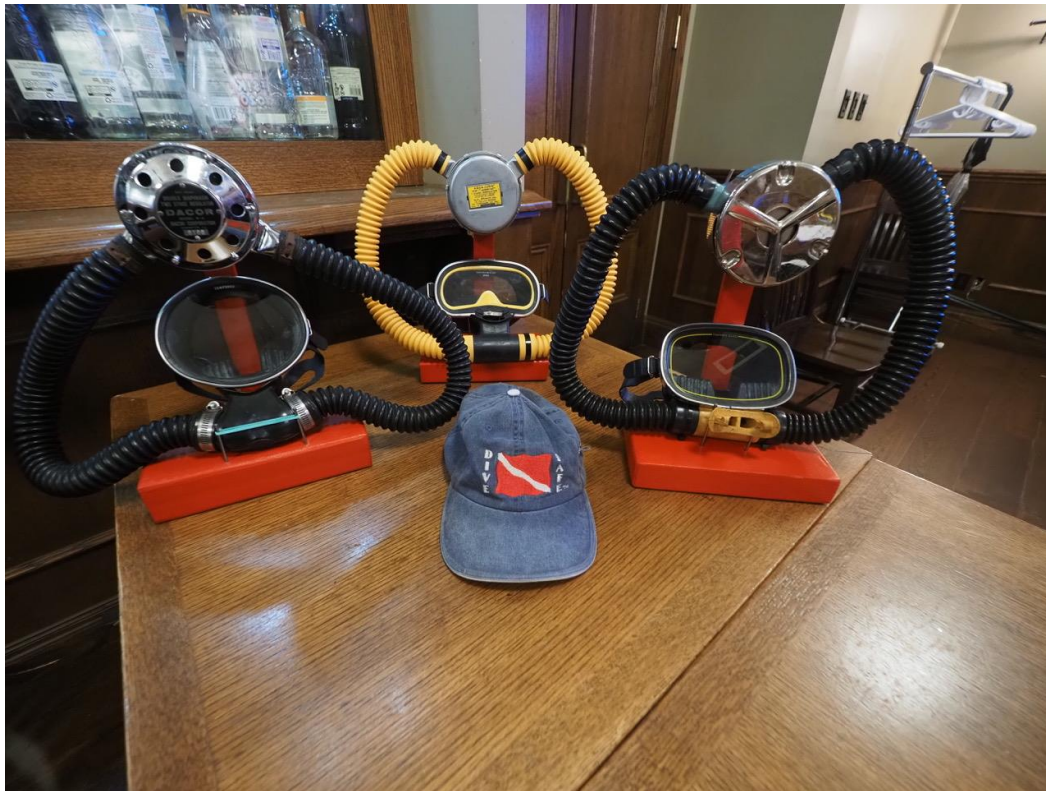
Vintage double hose regulators and high-volume masks from Barry's collection.